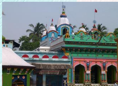
Khirachora Gopinath Temple (10 Kms far from the University)