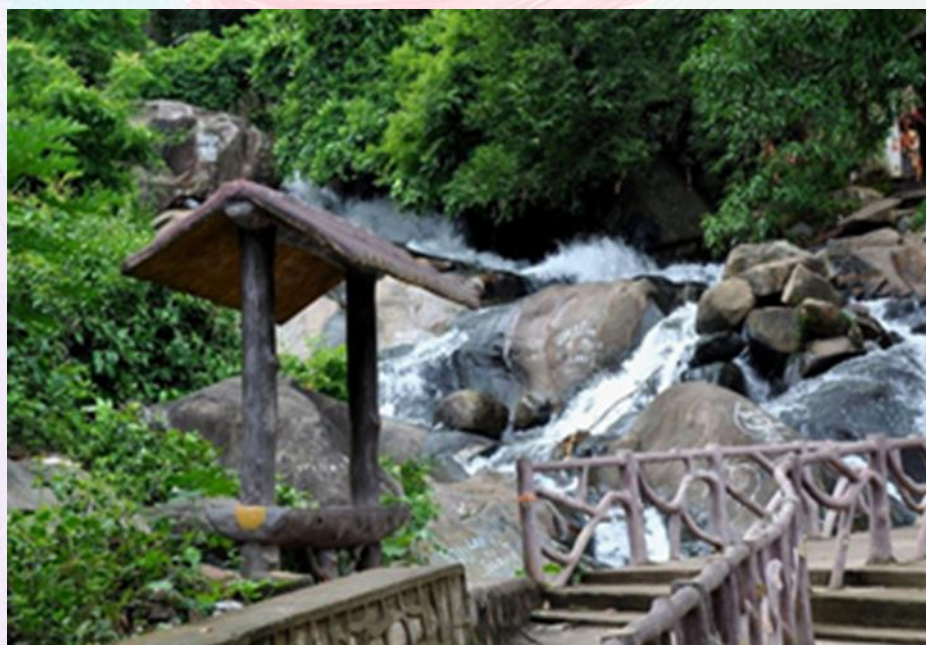
Panchlingeswar Temple (20 Kms far from the University)