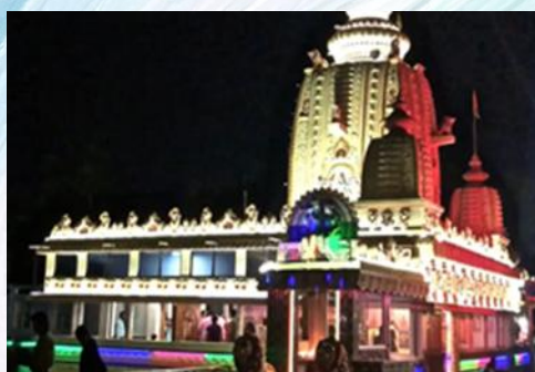
Radha Krishna Temple (01 KM far from Chandipur Beach)