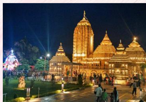
Emami Sri Jagannath Temple (01 Km far from the University)