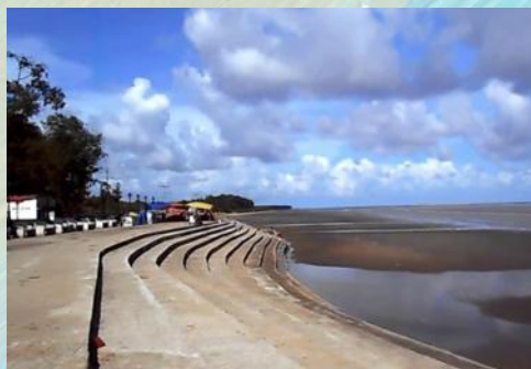
Chandipur Beach (30 Kms far from the University)